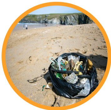
Litter collected at a beach clean

We currently have an economy which is linear, which means we make, use and dispose of products using up finite resources. It's estimated that only 9% of all plastic ever made has been recycled (4), so we know that recycling alone isn't the solution. Instead we need to move towards a circular economy, where products are designed to be used time and again, repairable, or re-purposed as new products. The whole life cycle of the product has been considered, so very little ends up in landfill.