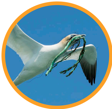
Gannet carrying fishing rope

Several chemicals used in the production of plastic materials are carcinogenic. Toxic contaminants can also accumulate on the surface of plastic materials that have broken up and been underwater for a long time. When marine animals ingest plastic accidentally, these toxic contaminants enter their digestive systems and could build up in the food web over time.