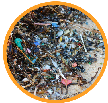
Microplastic pieces within seaweed