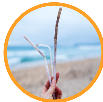
Single-use plastic straws